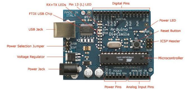
Fig. 1 Arduino embedded board with microcontroller

Arduino senses the environment by receiving inputs from many sensors and affects its surroundings by controlling lights, motors and other actuators.